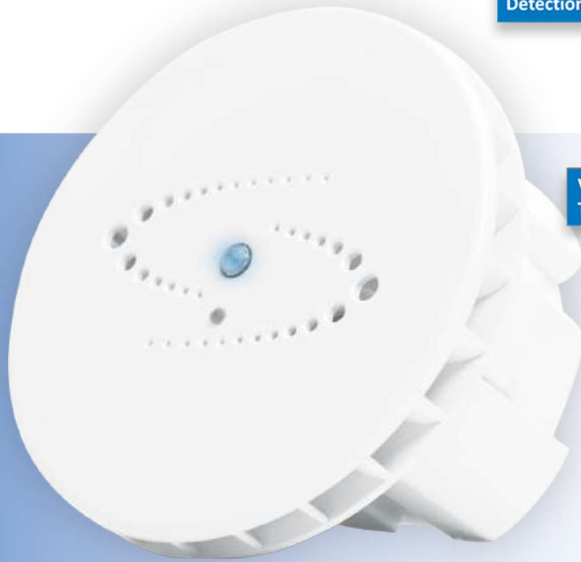
HALO Smart Sensor is Patented.